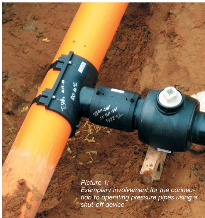
Picture 1: Exemplary involvement for the connection to operating pressure pipes using a shut-off device

An additional shut-off device is required for connection under working pressure. FRIALEN® spigot saddles are an economic alternative for the integration of a T-piece into the supply line. Saving potential amounts to up to 50% compared to conventional technology.