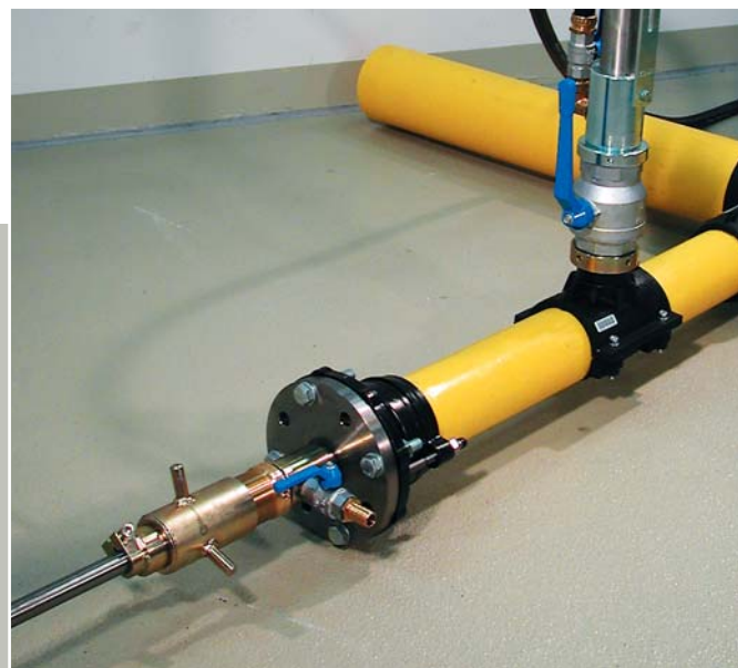
Picture 5: Drilling via AQUAFAST® clamp flange and FRIALEN® SPA shut off saddles with setting device