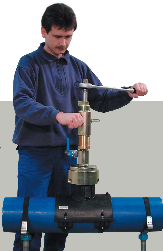
Picture 2: Direct, pressure free drilling of SA as reduced T-piece using drilling equipment by Hütz + Baumgarten

Fusing and drilling of mains is possible both under no pressure and under the maximum authorised working pressure (see also FRIALEN® data sheets SA, SA-TL and SAFL).